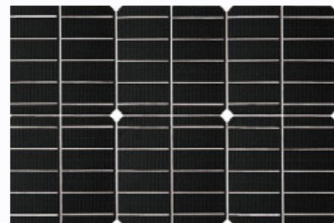
High efficiency monocrystalline silicon solar panel.