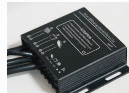
IP67 intelligent controller.