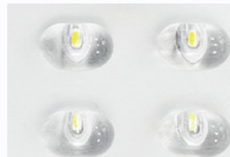
Use brand-new 3030 high luminous efficiency lamp beads.